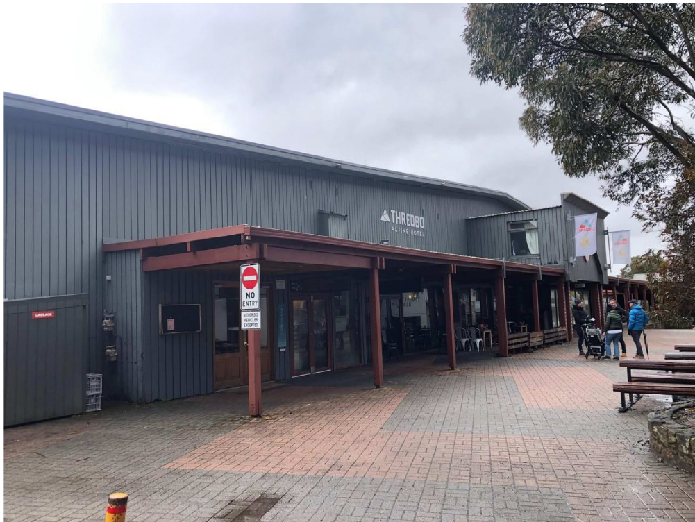
SOUTH-WEST ELEVATION ALPINE HOTEL